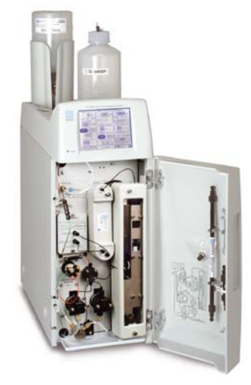
All components are easily accessed through the front chromatography panel.